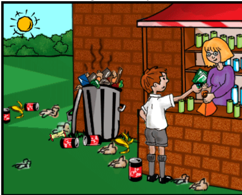
This image refers to question: 2