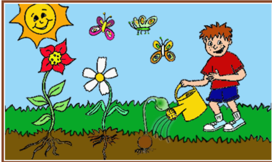
This image refers to question: 9

Before I go to school, I need to brush my hair.